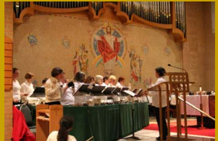
Bell Ringers (top) and Mass Choir (below) St Cecilia Sing Festival

Week of July 20th, Adult Choir School at the Cathedral. Singers from all over the Diocese are invited to sing in the chorus which will rehearse in the evenings and present a concert with orchestra on Friday evening.