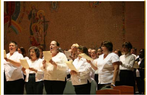
St Cecilia Sing Mass Choir 2008